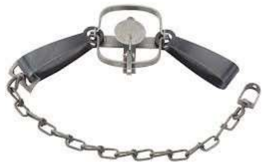
Double Long Spring Trap