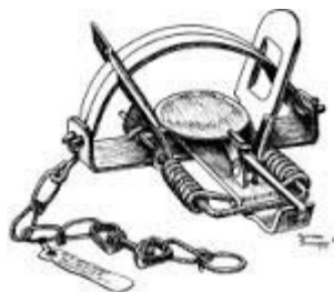
Coil Spring Trap